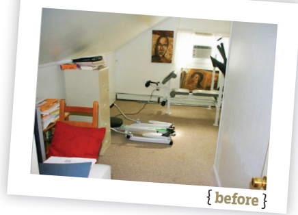
{ before }

← Skylights lend the illusion of height when raising the roof isn't an option.